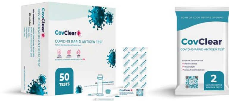
RAPID ANTIGEN PACKAGING

Packaging design requires balancing aesthetics with functionality and brand communication. The design must consider factors such as clarity of messaging, shelf appeal, consumer convenience, and sustainability, all while aligning with brand identity and regulatory requirements.